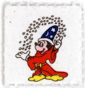
Image credit: Isd blotting paper The Sorcerer's Apprentice , 1977 (Institute of Illegal Images)

So many of the innovations associated with California, from LA's freeways to Google Maps, revolve around freedom of movement. This section of the exhibition focuses on mobility, from navigation to portability and exploration. Exhibits include Waymo's self-driving car, mountain bikes and the first consumer GPS device.